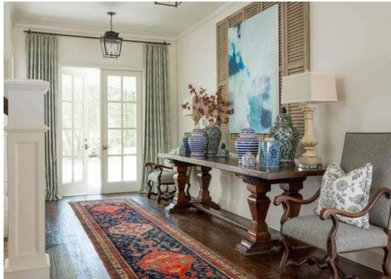
Picture (5): 19 th century designed house