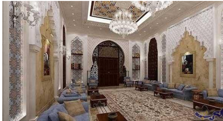
Picture (3): seating room design inspired by Classical Islamic style