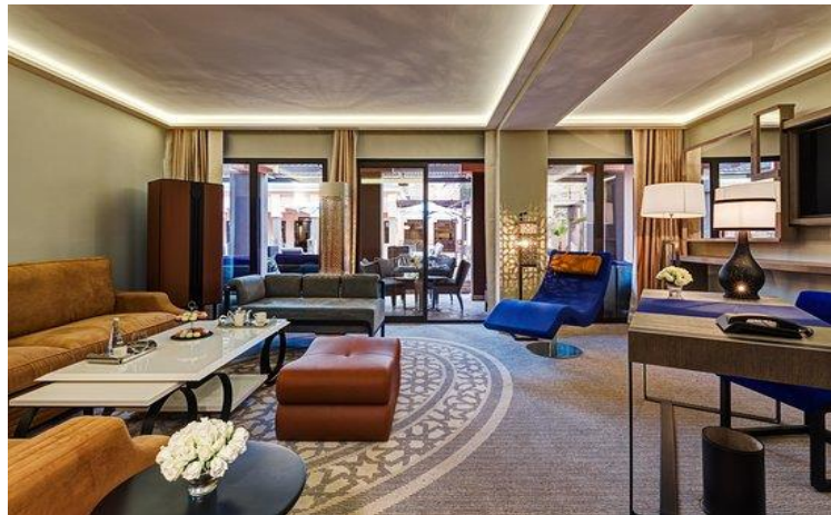
Picture (2): Geometric ornaments on the floors of the Royal Mansour Hotel Marrakech- Morocco Source: https://www.tripadvisor.fr .