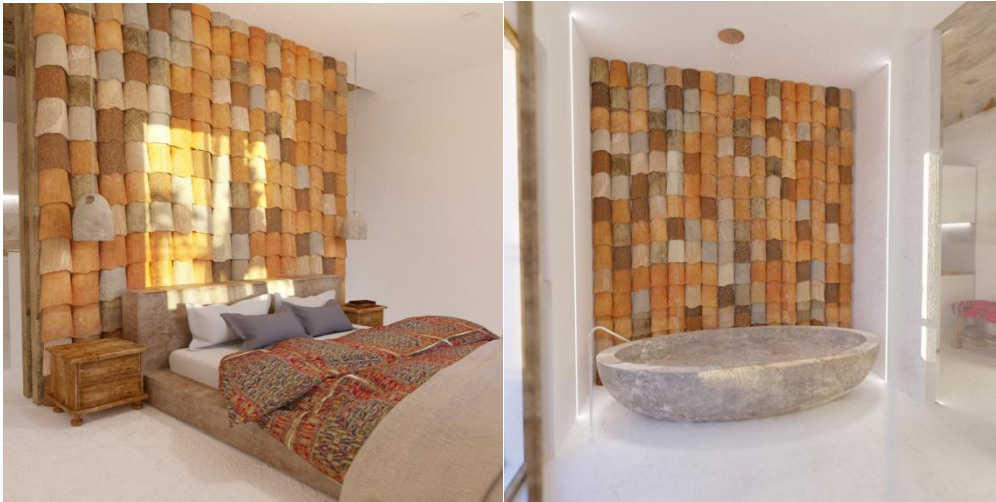
Picture (4): Hotel apartment in Bulgaria