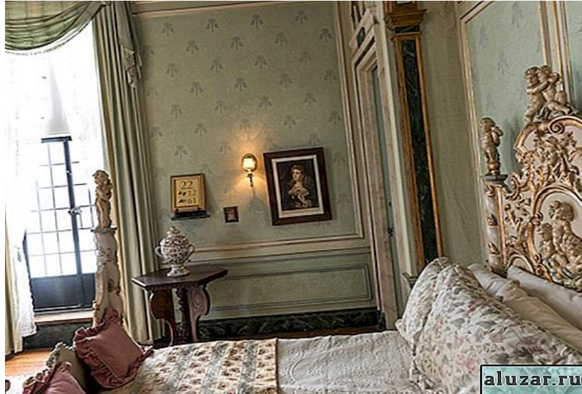
Picture (6): bedroom with classical style