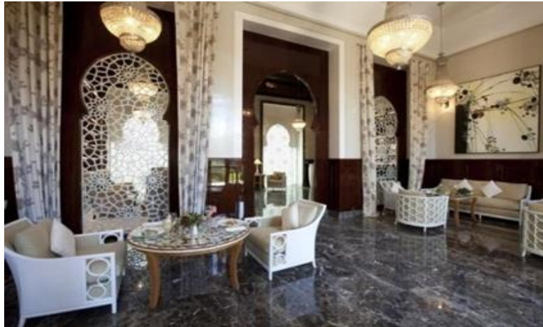
Picture (1): Geometric ornaments in the lobby of the Mansour Royal Hotel