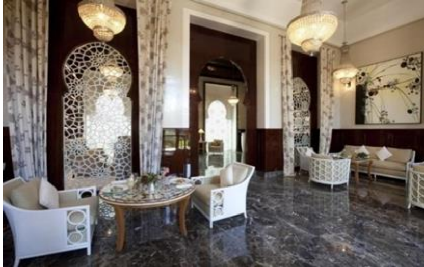
Picture (1): Geometric decorations in the lobby of the Royal Mansour Hotel Marrakech