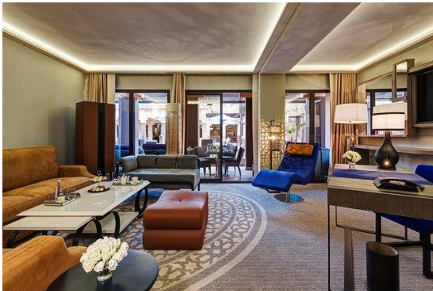
Picture (2): Geometric decorations on the floors of the Royal Mansour Hotel Marrakech, Morocco